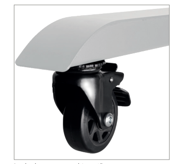
Includes non-marking 4' locking/braked castors